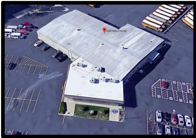
Driving Academy (Branch Campus)