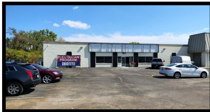
Columbus (Branch Campus)