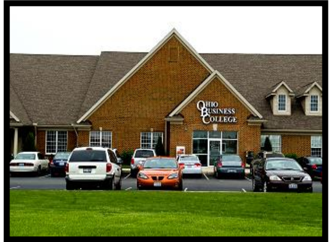
Sandusky (Branch Campus)