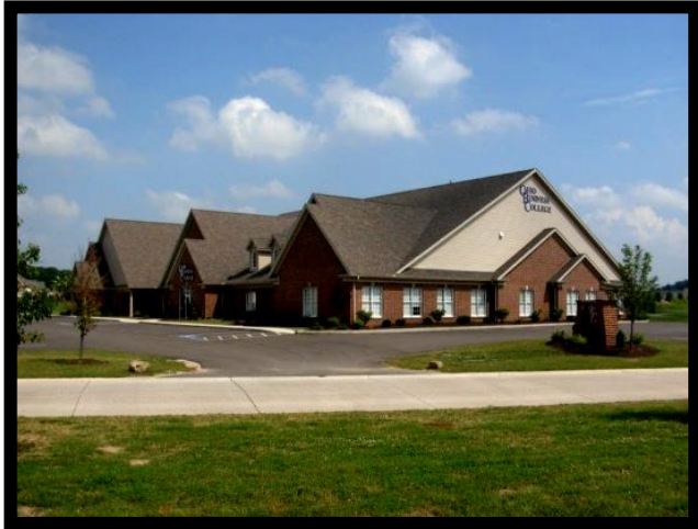
Sheffield Village (Main Campus)