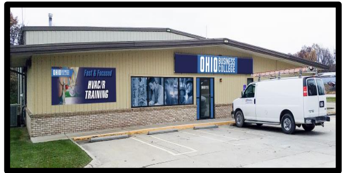
Trades Academy (Extension)