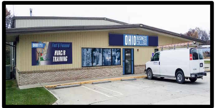
Trades Academy (Extension)