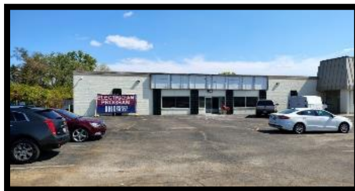
Columbus (Branch Campus)