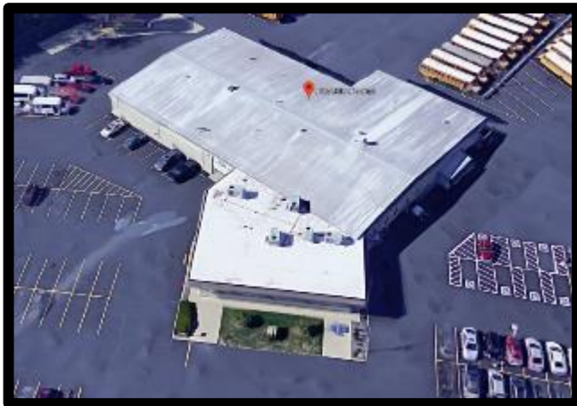
Driving Academy (Branch Campus)