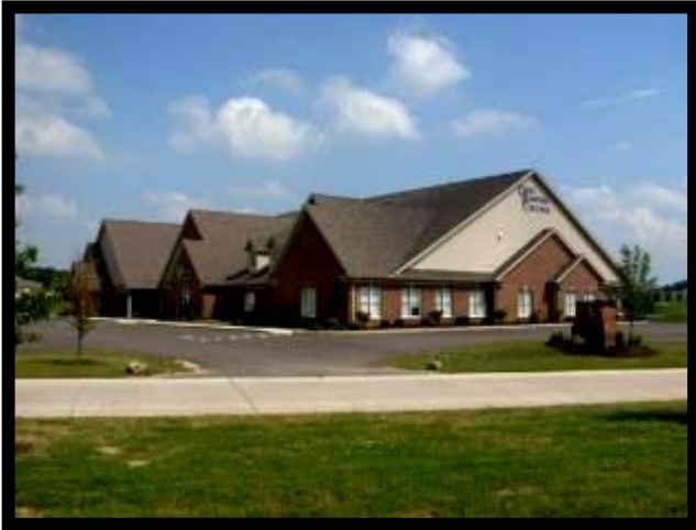
Sheffield Village (Main Campus)