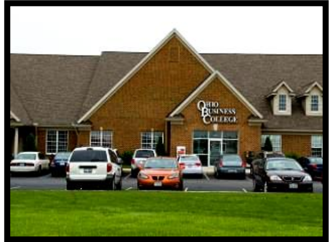
Sandusky (Branch Campus)