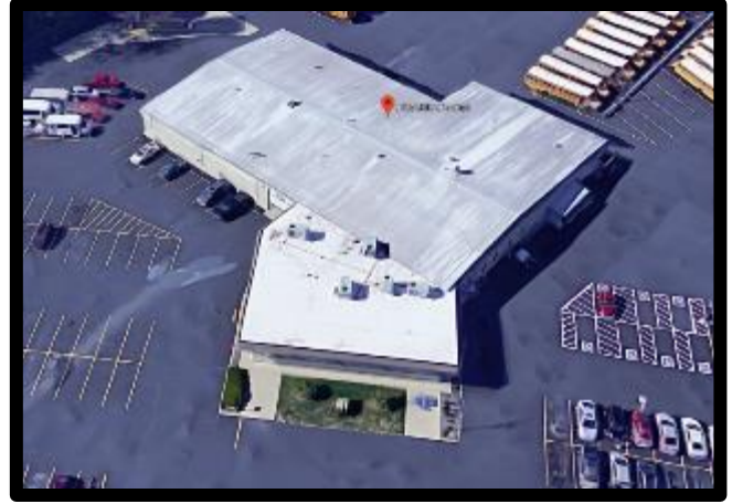
Driving Academy (Branch Campus)