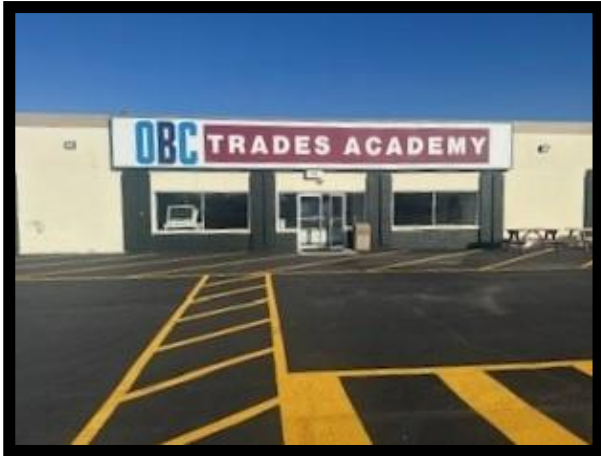
Columbus (Branch Campus)