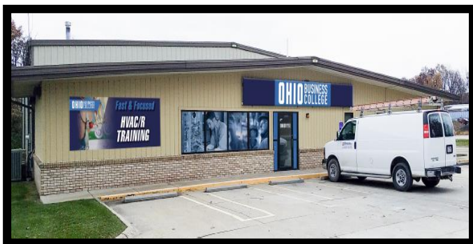
Trades Academy (Extension)