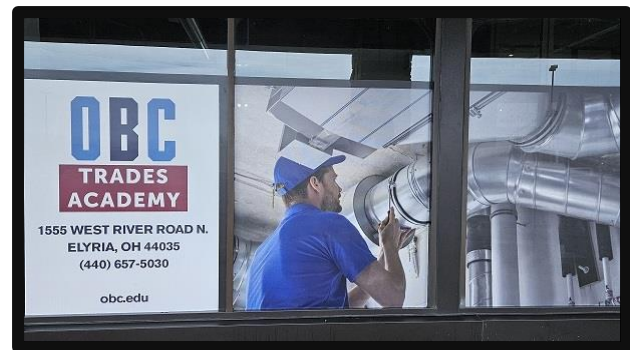
OBC Trades Academy (Extension)