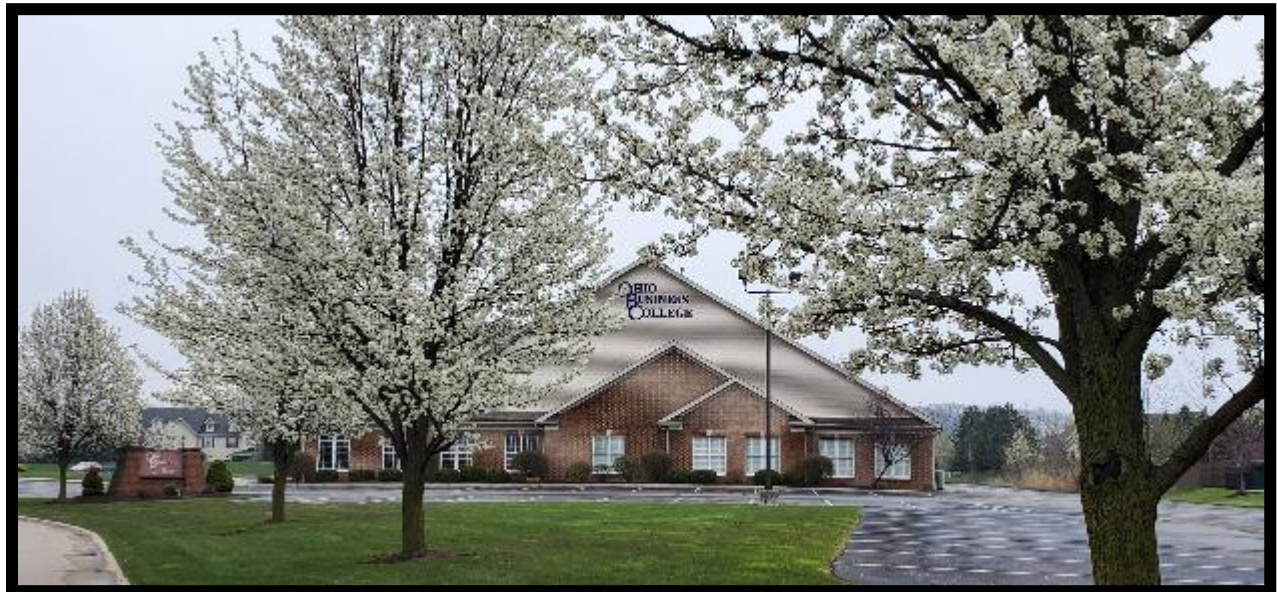
Sheffield Village (Main Campus)